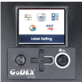
Color TFT LCD and operation panel for easy and intuitive operation

Full functions, powerful features, user friendly interface and high extensibility make the RT700i perfect for retail and industrial applications