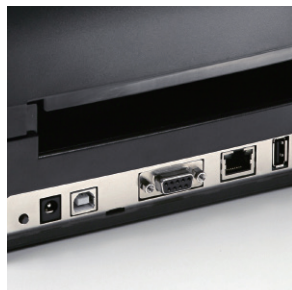
Ethernet, USB 2.0, Serial and USB host are standard features adding flexibility and power