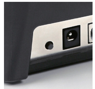
Innovative "C" button makes label Calibration simple and fast