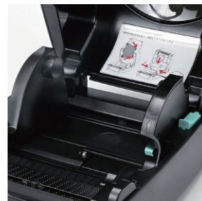
Rod-less label roll holder for easy loading and smooth feeding